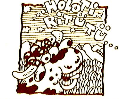
HEUT IS ER LUSTIG, DA OCHS 'N WILLI