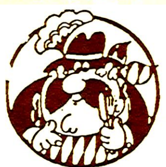
OCHS N XAVERL (KNÖDEL, WEISSWÜRSCHT UND BIER SIND SEIN ELIXIER)