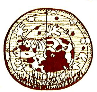
OCHS 'N WOLPERTINGER