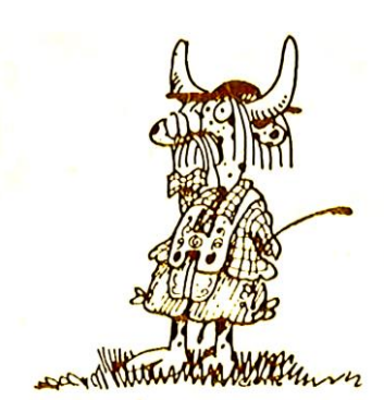
"I GLAUB I WERD A OCHS I" (WIKINGER WILLI ??)