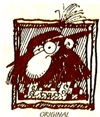
OCHS 'N SEPP