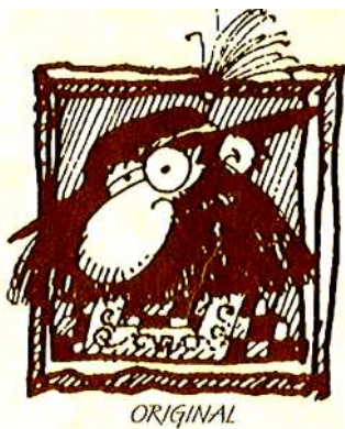
OCHS 'N SEPP Achtung! Fälschung